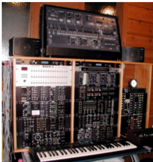
The Monster Modular Synthesizer at the recording studio

Looking for a fun and educational alternative to traditional summer music lessons? Give Music Technology lessons a try this summer! Music technology lessons are designed to get students hands on with real pro audio gear in a pro recording facility right from the start while developing great study skills. These lessons are a great way to show students how to apply the knowledge they have gained in piano lessons. There are a wide variety of classes available for students ages 10 and up. Look for more info in the course catalog in this issue! Better yet, make a free, no-obligation ap-